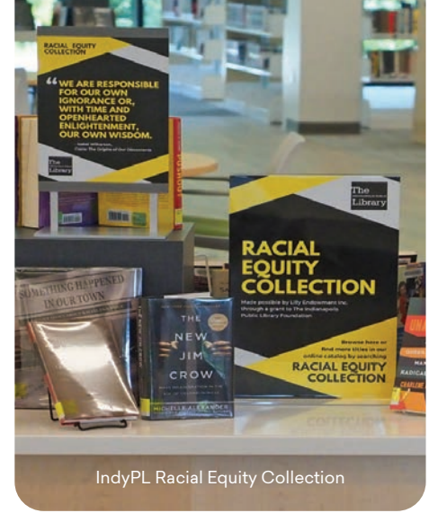
IndyPL Racial Equity Collection