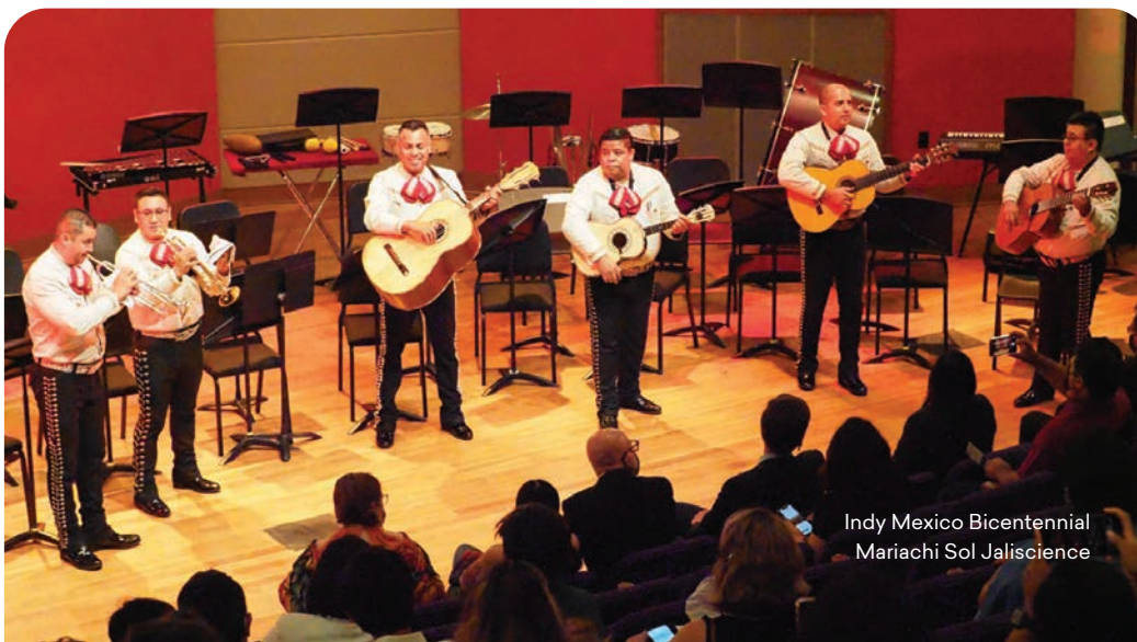
Indy Mexico Bicentennial Mariachi Sol Jalisco