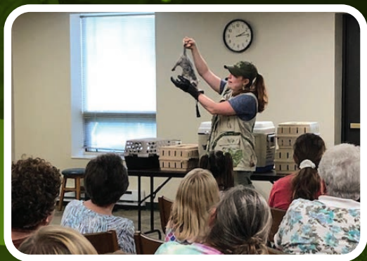
2021 Summer Reading Program Animal Show