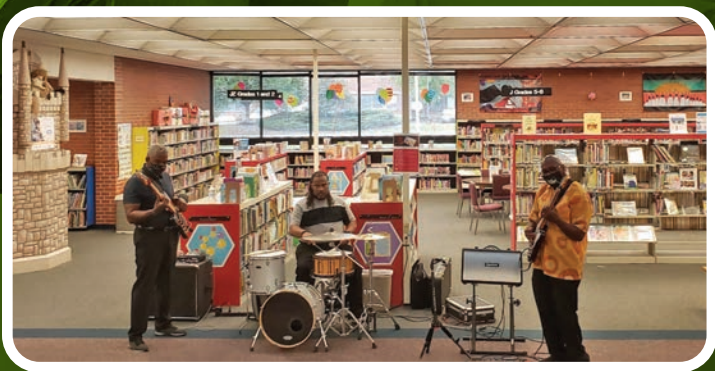
Band Performance at Nora Branch