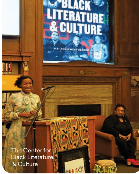
The Center for Black Literature & Culture