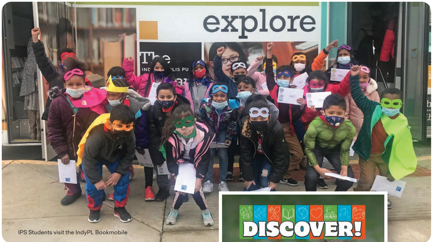
IPS Students visit the IndyPL Bookmobile