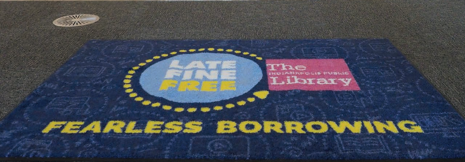
Grand opening of West Perry Branch Library-July 17, 2021