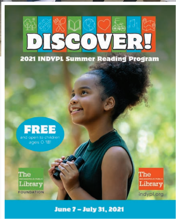
2021 Summer Reading Program Brochure